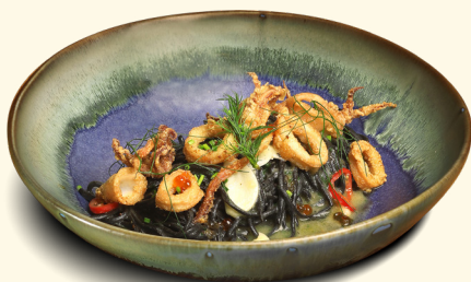
Tonnarelli con Calamari e Patate

Handmade pasta with oxtail ragu in tomato sauce, served with pecorino, raisins, and pine nuts