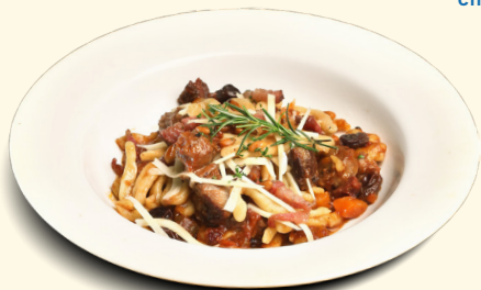
Strozzapreti alla Vaccinara