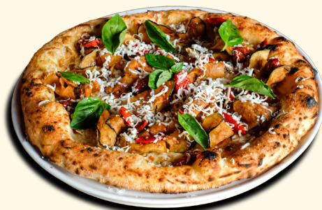
Salsiccia e Friarielli nel ruoto Campania

Not the classic Napoli pizza as it is cooked in an iron tray (ruoto), with topping of fior di latte, Italian sausages, and friarielli which is a particular kind of spinach typical of Naples