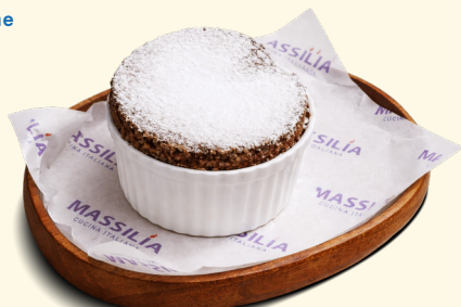
Soufflé al Cioccolato e Gorgonzola

Fluffy egg yolks blend with sugar, served with biscotti and fresh berries