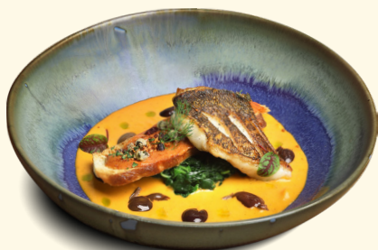
Pesce alla Livornese